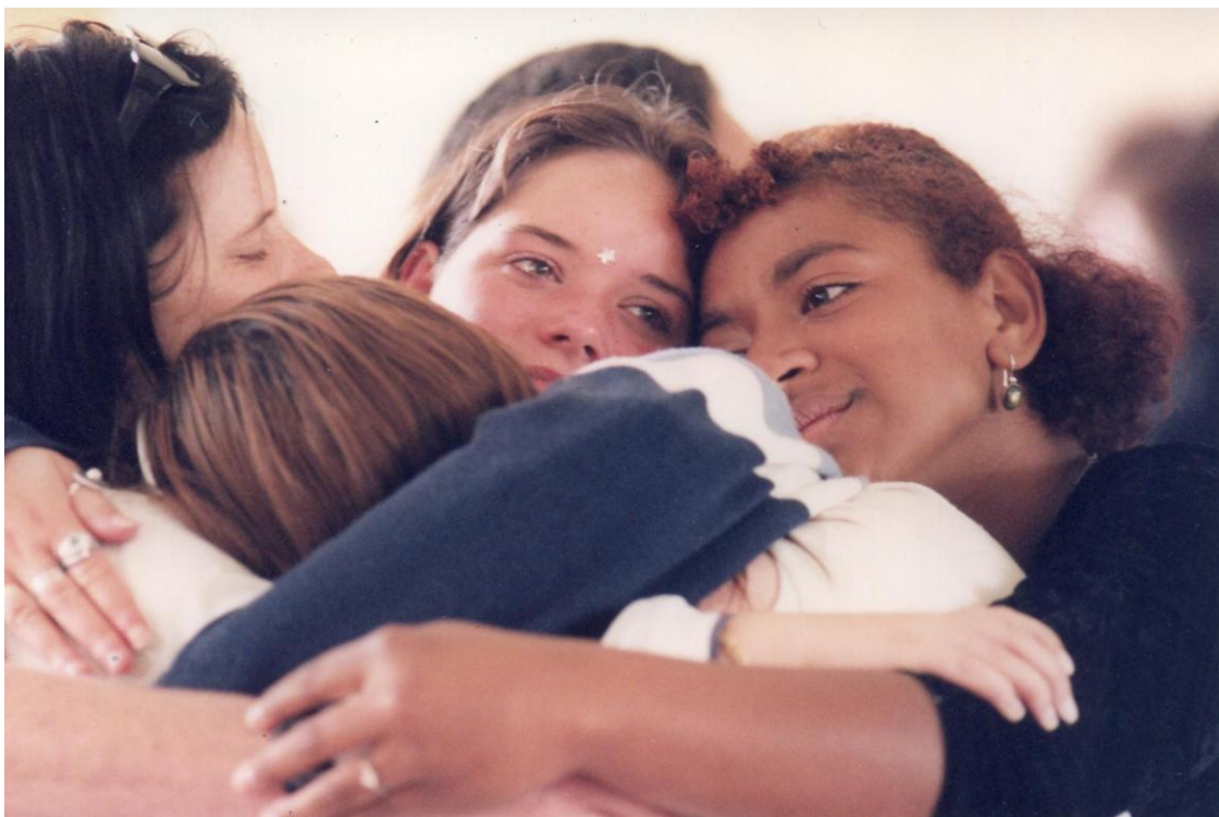
A supportive group hug at a Youth Insearch program.