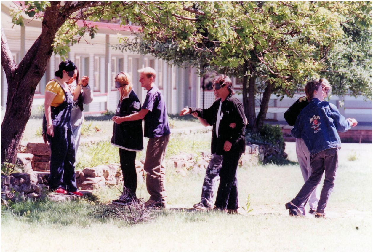
A trust walk at a Youth Insearch program.